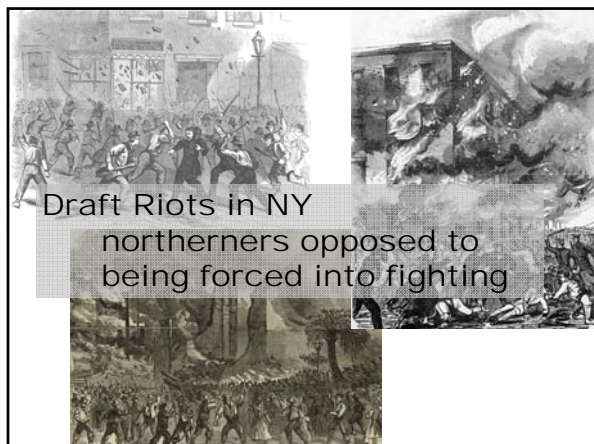
Draft Riots in NY northerners opposed to being forced into fighting